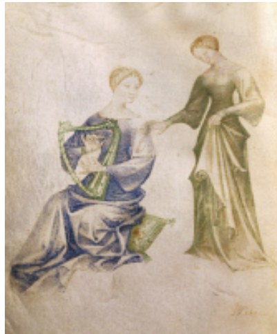
Giovannino de Grassi. Two ladies playing harp ( Taccuino dei Disegni , Bergamo, Biblioteca Civica). The elegant dresses and haircut of the two female figures plainly suggest their high social status. This painting seems to suggest the popularity acquired by the harp in fourteenth-century courts.

The case of Vannozzo, who decided to abandon the lute for the harp, seems to suggest that these two instruments were regarded and used differently at court. The first one, notoriously employed by buffoons, seems to have accompanied popular genres, such as jesters' performances or the frottola; indeed, in Sachella's frottola Guai a quel pularo (verses 22-8) 42 , the poet mentioned the sounds of the laguto (lute) and of the ghitarra , as the two instruments that usually accompany his poems. Considering that these compositions were addressed to a celebrating audience, it looks like that the lute had been destined to entertaining genres. Harp seems to have been preferred to accompany the most elegant musical and poetic genres as well as worthy to be played by the members of the social elite.