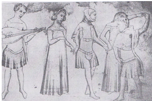
This drawing (part of a collection of Lombard drawings) plainly the recreational purposes the lute was employed for. Here indeed a group of people is dancing accompanied by the sound of a lute.