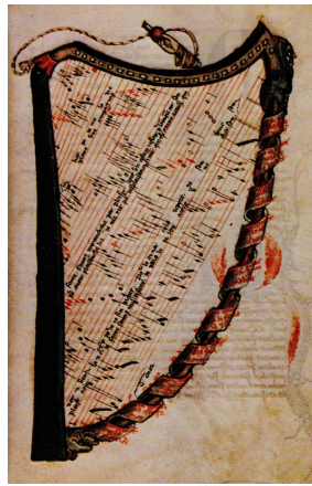
Jacob de Senleches, La harpe de melodie , Chicago, Newberry Library, Ms. 54.1, f. 10r.

Here are the qualities of Senleches' harp: