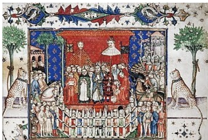
Scene from The crowning ceremony of Giangaleazzo Visconti by Anovelo da Imbonate, in Giangaleazzo's Missal, now in Milan, Museo della Basilica di S. Ambrogio.

By the end of the fourteenth century onward, when Milan turned into the Viscontian signoria , trumpeters became functional images of the new lordly power. Describing the parade which accompanied Giangaleazzo from the Castle of Porta Giovia to the basilica of Sant' Ambrogio during the ceremony of his ducal investiture (1395), Corio wrote that the Duke was followed by a « large number of jesters, and music instruments ». 10 Although he does not specify what kind of instruments he is talking about, we can imagine that such a pompous procession was followed by trumpets and other different types of winds. Nevertheless, further information is provided by an illuminated miniature painted in a Missal donated by the Duke to the church of Sant' Ambrogio.