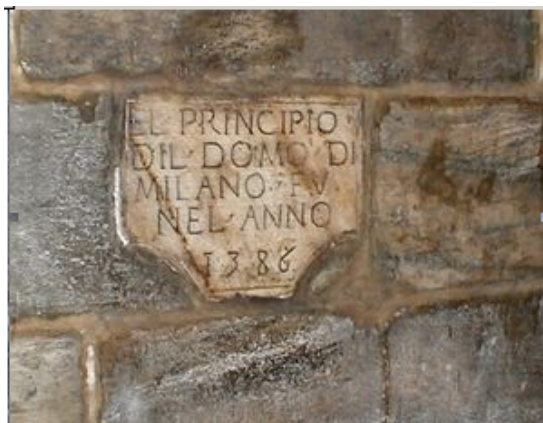
The Duomo's foundation stone, showing the starting date of its building (literally, "The beginning of Milan's Duomo was in the year 1386")

In 1386 the building project of a new cathedral was officially commenced by the will of Giangaleazzo Visconti. Aiming to express his own devotion to the Virgin after the defeat of his uncle Bernabò in the 1385 coup d'état – which allowed him to become the new lord of Milan – Giangaleazzo wanted the new Duomo to be dedicated to the birth of Mary ( Mariae nascenti ).