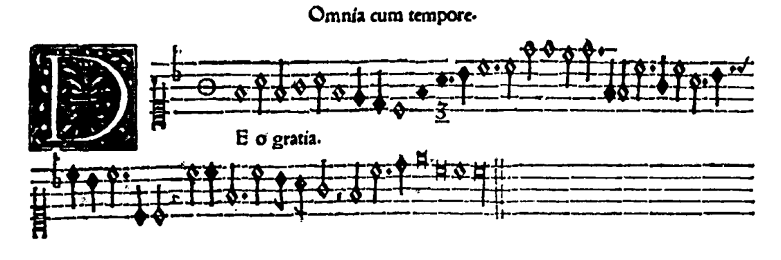
PLATE III. Top J. Petreius, Tomus tertius psalmorum selectorum, Nuremberg, 1542, Discant, no. 40. Bottom J. Petreius, Tomus tertius psalmorum selectorum, Nuremberg, 1542, Tenor, no. 40.