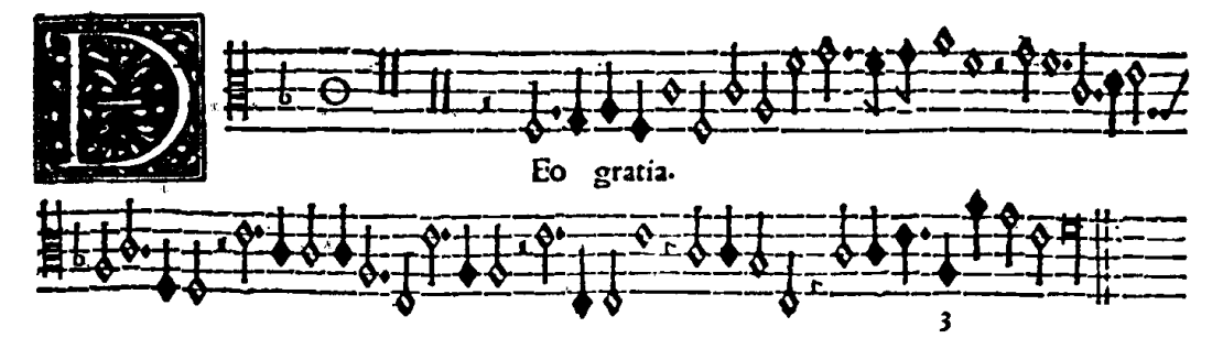
PLATE IV. Top J. Petreius, Tomus tertius psalmorum selectorum, Nuremberg, 15Å2, Alto, no. 40. Bottom J. Petreius, Tomus tertius psalmorum selectorum, Nuremberg, 1542, Bass, no. 40.