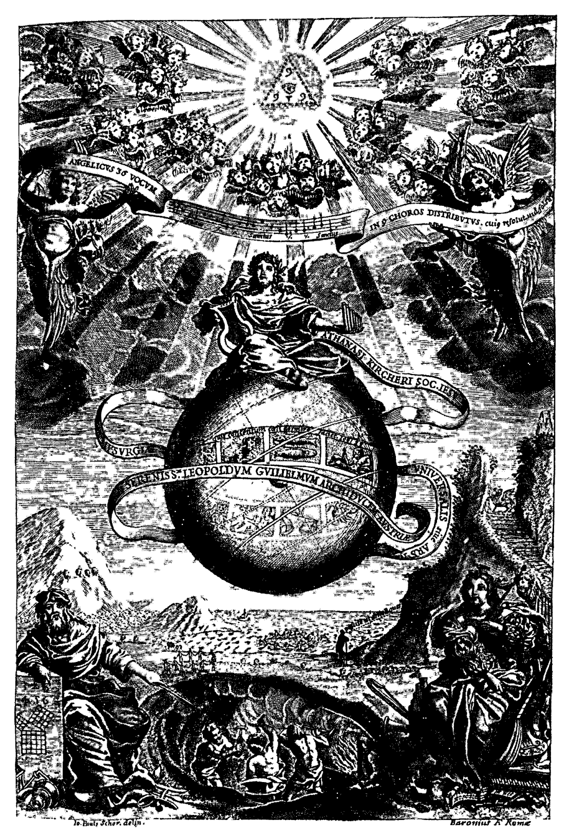
PLATE I. Athanasius Kircher, Musurgia universalis, Rome, 1650, frontispiece.